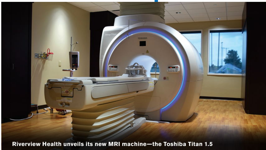
Riverview Health unveils its new MRI machine—the Toshiba Titan 1.5

For sponsorship information or to purchase tickets, contact Maggie Owens at mkowens@riverview.org or call 317.776.7938.