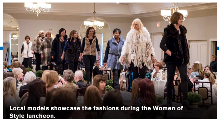
Local models showcase the fashions during the Women of Style luncheon.

The Foundation hosted the 25th Annual Heartfelt Thanks Golf Outing at Pebble Brook Golf Course. BMO Harris Bank was again our presenting sponsor, and we had a beautiful day of fun, fellowship and great golf, while raising funds to support our many projects. Gaylor Electric, Inc. provided another wonderful lunch and dinner for the attendees.