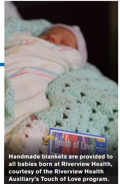
Handmade blankets are provided to all babies born at Riverview Health, courtesy of the Riverview Health Auxiliary's Touch of Love program.

These grants are made possible through gifts received by the Women of Vision Giving Club and proceeds from our Women's Endowment Fund. If you are interested in learning more about the giving club and how you can join, please visit riverview.org/women-of-vision-giving-club or call 317.776.7938.