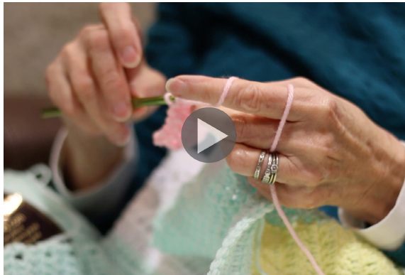
In 2017, more than $35,000 was granted to Riverview Health departments from the Women of Vision Giving Club to support equipment and programs to benefit the health of women and children. Visit riverview.org/WomenOfVision to watch a video and learn more.